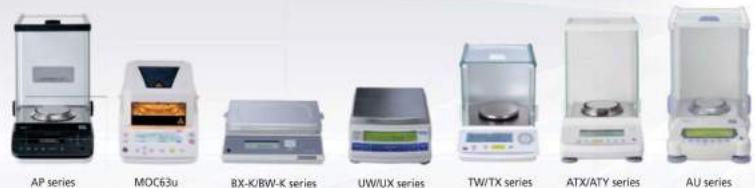
UniBloc family of balances