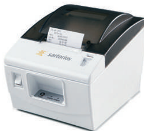
Plug & Play Standard printer YDP40

Two large, easy-to-adjust feet and an outstandingly simple-to-read level indicator on the front make it a breeze for you to level the Practum®. This helps ensure accurate, repeatable weighing results.